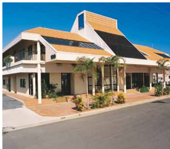
Kaplan International College Cairns

Cairns is a major tourist destination and all international visitors immediately feel welcome and at home in the city.