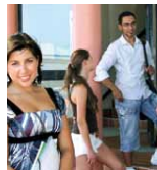
Kaplan International College Students