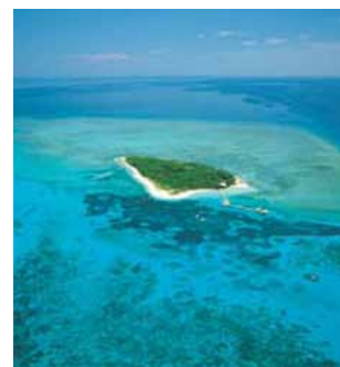
Cairns is a great place for water sports.