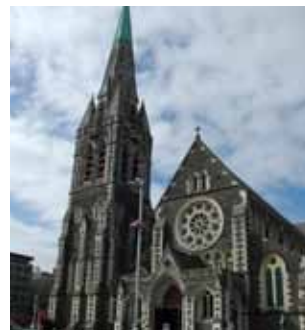
Christchurch Cathedral Square