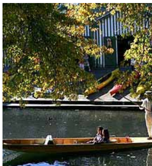
Punting on the Avon River