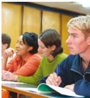
Students in the classroom