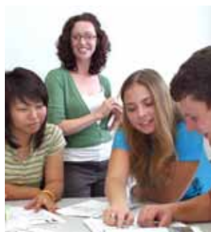
Kaplan International Colleges teacher and students

Students can join the Centennial Leisure Centre or the Les Mills Gym, both located close to the college, for indoor sports and fitness training. The centre has excellent facilities including a fitness centre, swimming pools, a sauna, spa, and steam room.