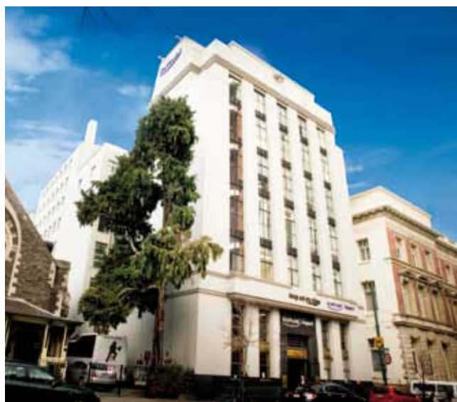
Kaplan International College Christchurch

Kaplan International College Christchurch is ideally situated in the city centre next to Cathedral Square and within a moment's walk from cafes, bars, shops, libraries and central bus routes.